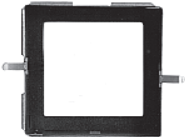
NS-100 Filter Holding Frame

The NS-100 is made from heavy 16 gauge Galvanized Steel, the NS-100 Filter is designed for building either small or large filter banks to hold a wide range of filters from the throwaway type filter to a high efficiency HEPA filter. An interlocking lip provides a solid, durable, vibration-less filter bank, simple yet economical to erect. Lip construction on two sides of the frame join with male sides of adjacent frames for rigidity.